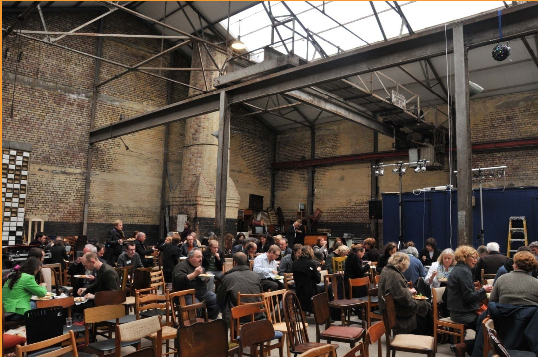
Delegates networking and having lunch at the A Foundation, Liverpool